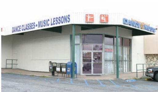
HERMOSA SCHOOL OF DANCE & MUSIC

Complimentary Dvd's also have all been mailed out, we have a few extra's left for sale if you were looking to purchase another copy.