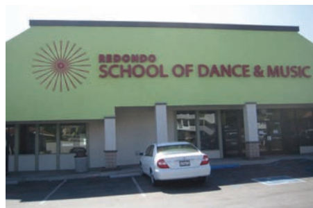
REDONDO SCHOOL OF DANCE & MUSIC